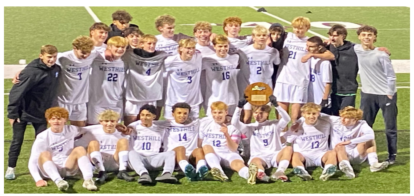
NYSPHSAA CLASS B REGIONAL CHAMPIONS - BOYS' SOCCER

From thrilling finishes to record-breaking performances, this fall showcased the best of high school sports, reminding us of the power of teamwork, dedication and community pride. Congratulations to all the teams and athletes who made the fall 2024 season unforgettable.