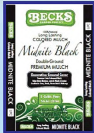
Becks Midnite Black