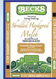
Becks Hardwood Mulch

High Quality Mulch – HUGE 30 Pound Bags - Covers 2 Cubic Feet!